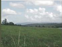
Fisher's Hill & Tom's Brook Battlefields Preservation Plan